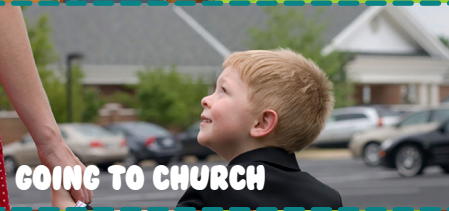
GOING TO CHURCH