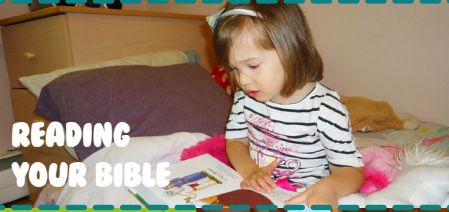
READING YOUR BIBLE