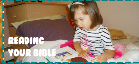
READING YOUR BIBLE