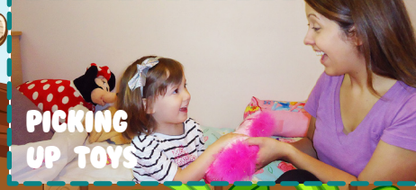
PICKING UP TOYS