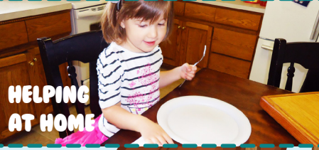
HELPING AT HOME