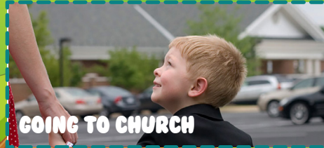
GOING TO CHURCH