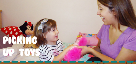
PICKING UP TOYS