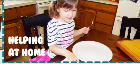
HELPING AT HOME